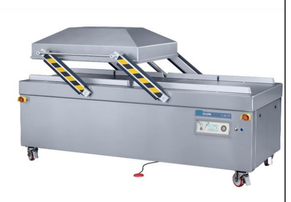
*with option automatic lid